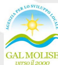
GAL MOLISE VERSO IL 2000 (ITALY)