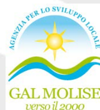
GAL MOLISE VERSO IL 2000 (ITALY)